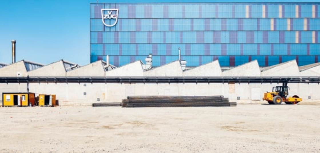
The construction site for the Zephyr Ost building is ready

We fully appreciate that this situation is challenging for our customers, and extend our heartfelt thanks for the great loyalty and goodwill that the V-ZUG Group is constantly being shown.