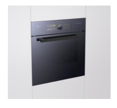
Photo 2 The new Combi-Steam MSLQ from V-ZUG is a triumph of form and function