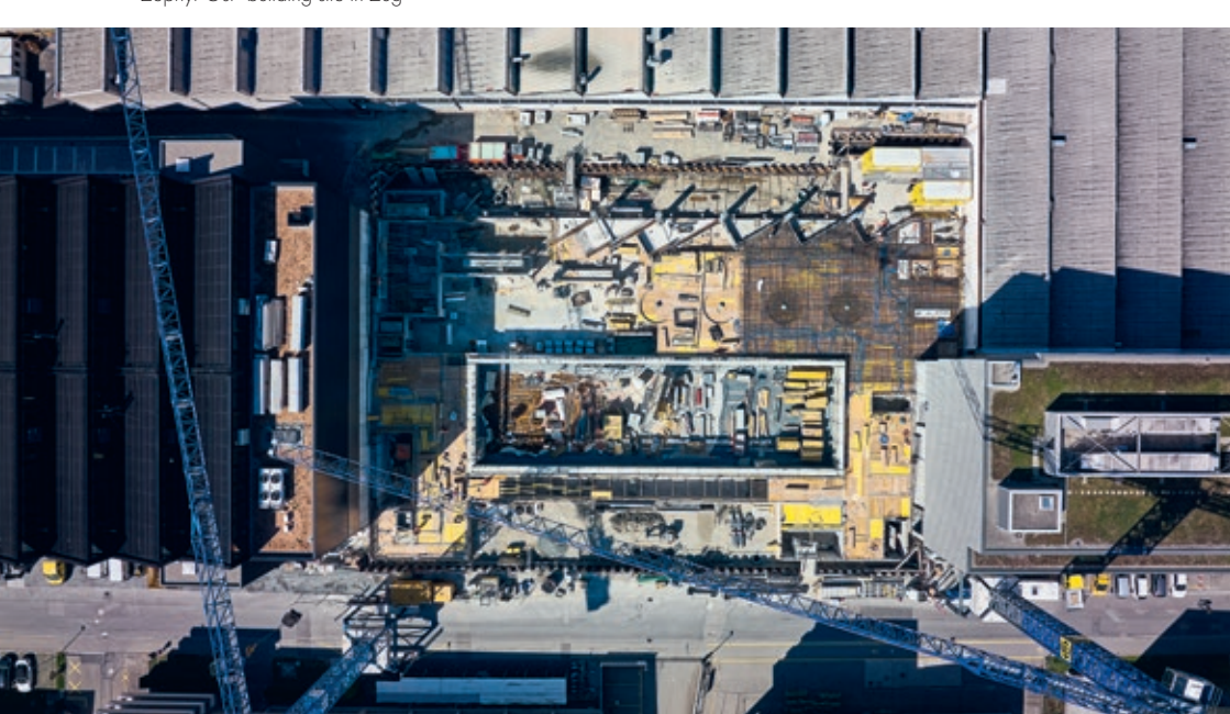
"Zephyr Ost" building site in Zug

The construction works on the production building "Zephyr Ost" are progressing according to plan. The presence of representatives from local government and the SWISSMEM industry association at the laying of the foundation stone in March underlined the importance of this milestone for the development of V-ZUG and the Tech Cluster Zug (Metall Zug Group). The equipment is scheduled to be installed from the fourth quarter of 2023, with production starting up in 2024.