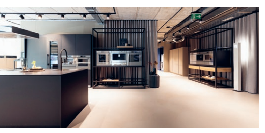
ZUGORAMA in Chur reopened in March 2022